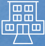
Assisted Living Facility Placement