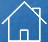
Senior Real Estate Specialist