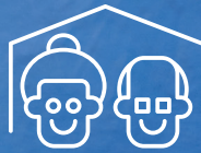
Home Health Care